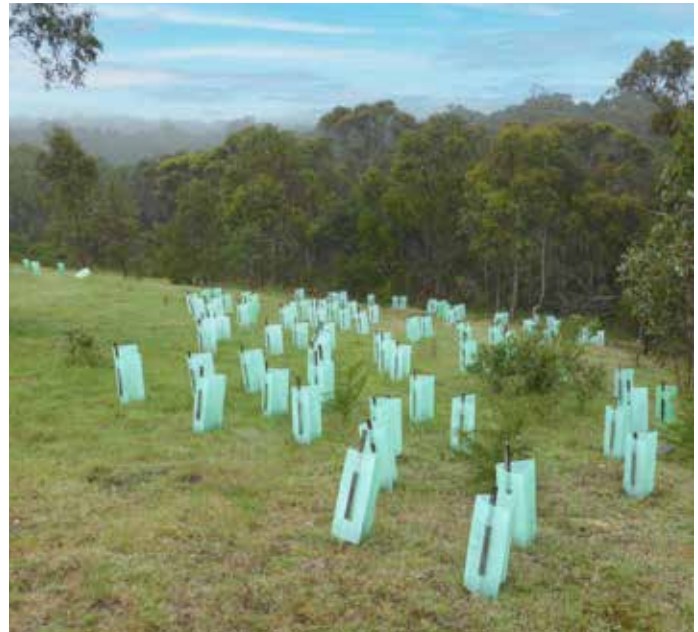
Top: Shelterbelt establishment with indigenous trees and shrubs on property boundary.